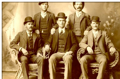
The Wild Bunch

ETTA PLACE is one of American history's most mysterious and elusive women. Almost nothing is known of her life. The photo at left is the only known image of Etta.