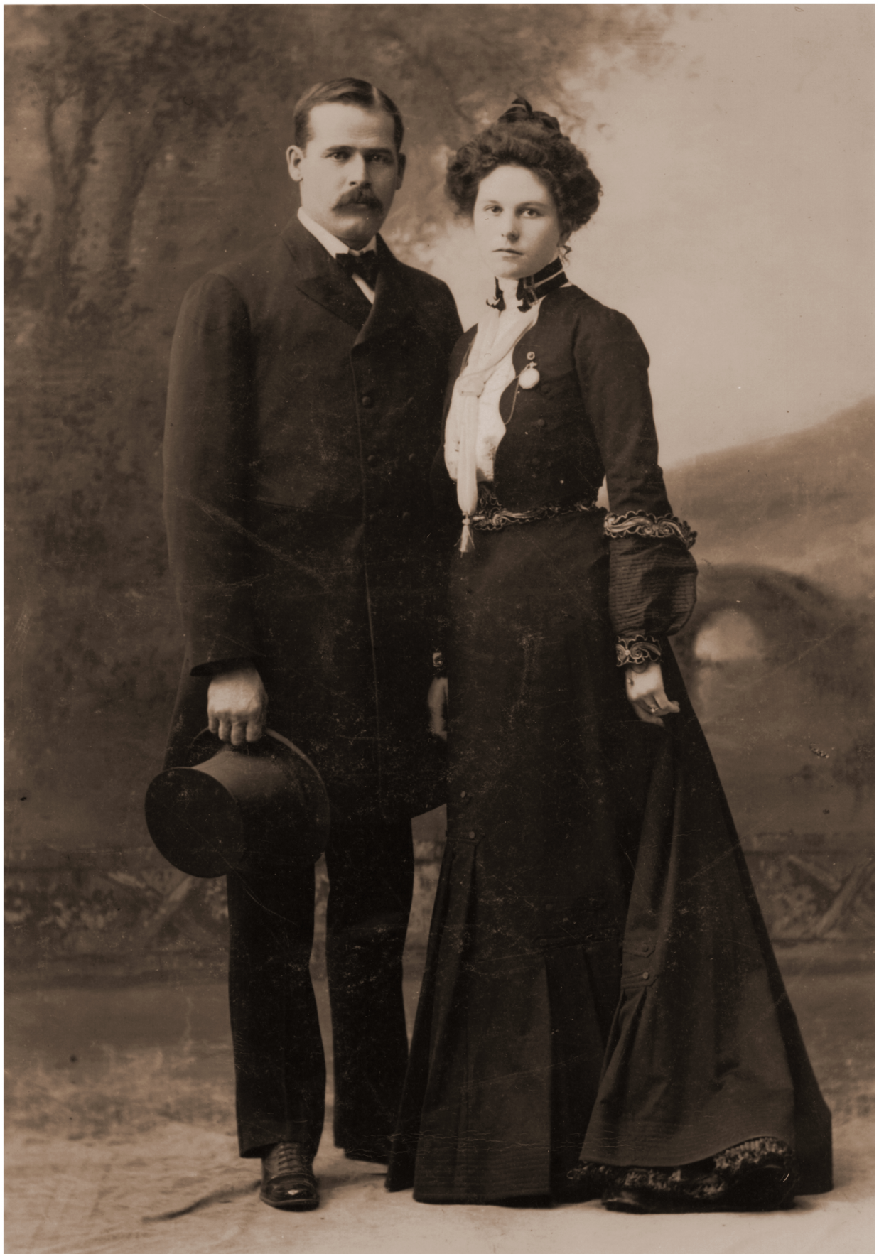
Sundace Kid and Etta Place in 1902